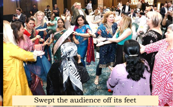
Swept the audience off its feet