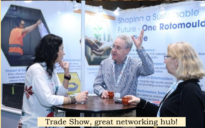
Trade Show, great networking hub!