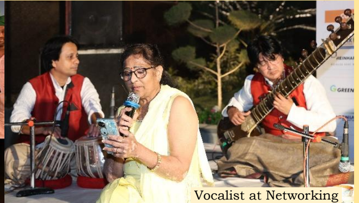
Vocalist at Networking