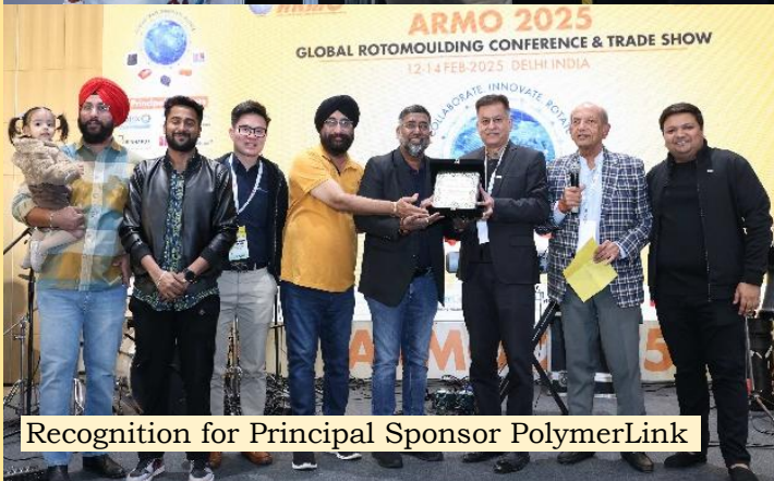
Recognition for Principal Sponsor PolymerLink