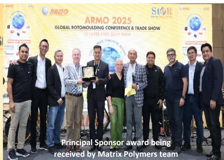
Principal Sponsor award being received by Matrix Polymers team