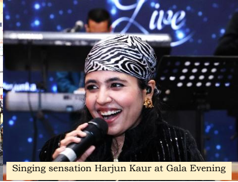
Singing sensation Harjun Kaur at Gala Evening