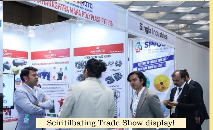
Scritilbating Trade Show display!