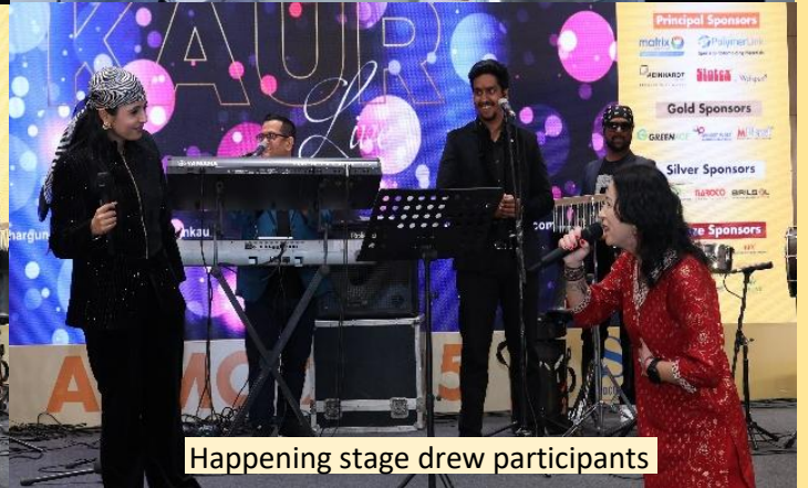
Happening stage drew participants