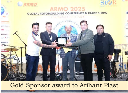
Gold Sponsor award to Arihant Plast