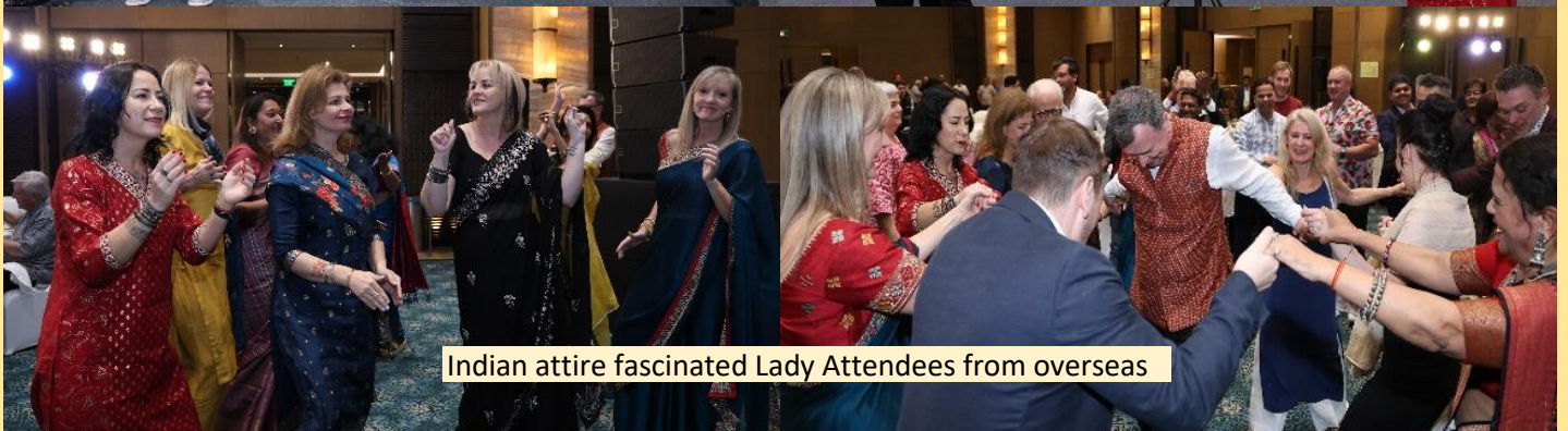
Indian attire fascinated Lady Attendees from overseas