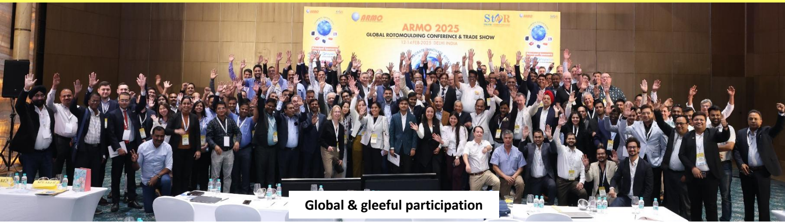
Global & gleeful participation