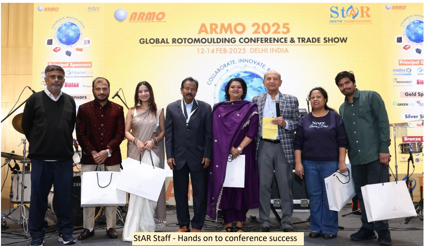
StAR Staff - Hands on to conference success

Until next time, let's keep shaping the future - one mould at a time!