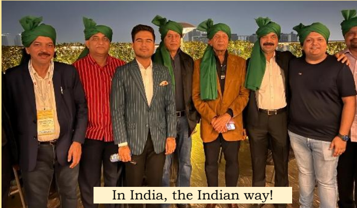
In India, the Indian way!

The energy, enthusiasm, and innovation displayed at ARMO 2025 left a lasting impression on all participants. As the event came to a close, the excitement for the future of rotomoulding was at an all-time high.